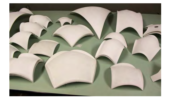
Figure 1: Study of shell forms at Isler's office

In general, Swiss architecture to this day is strongly influenced by a tradition of craftsmanship and construction in which precision and the appropriate consumption of materials were also always signs of efficient resource management. This specific form of efficiency also shapes the infrastructure of the country with civil engineering constructions such as bridges and tunnels. Examples of this understanding of efficiency are buildings of engineers such as Robert Maillart or Christian Menn – in their works the static necessity develops a formative power and as such reveals itself in the problem of loading and bearing as a form of architectural expression.