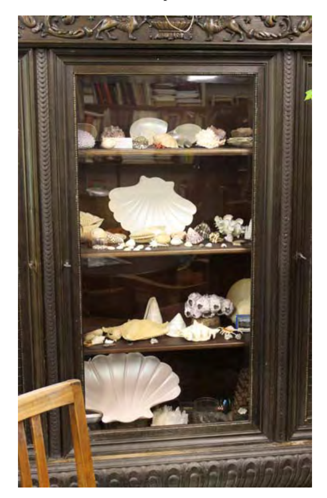
Figure 2: Isler's collection of shells

creations (Figure 2). In these natural forms, he saw "stiffened shells, double-curved shells, rotation shells, flawlessly formed shells in countless variations, wafer-thin and still resistant." [5, p. 52]. In Isler's perception of natural forms in general, the shell constituted the dominant principle. According to Isler, the shell's shape is always optimal: "It is natural law, and therefore also the most ecological form in the universe." [5, p. 54].