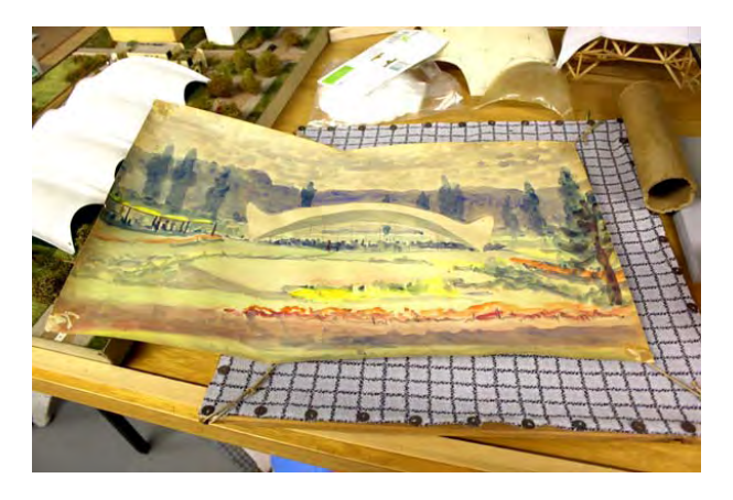
Figure 5: Water color drawing of shell by Isler

The contradictory impression is further reinforced by the deep division between interior and exterior space produced by the pragmatically placed planar windowfront along the shells' edges. This defines a precise border which not only interrupts the spatial flow, but also, as a result of the change in the language of forms, is perceived as a foreign body. The same is true for the entrance situation, which normally does not develop in a self-evident or inherent way from the shape, but rather must be added on as an artificial element. Hence, in Isler's projects the spatial transition between inside and outside often constitutes a place of breakage; spatially, the building seems to be added on, rather than integrated. This is also true because the shell shape generated is understood by Isler as a pure, unchangeable form and expression of natural laws. For this reason, it experiences no later adaptation to the circumstances of the real place of construction.