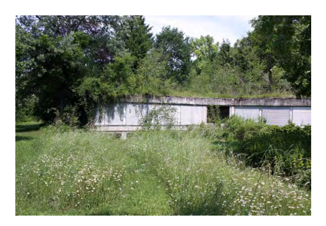
Figure 3: Isler's office, Spring 2011

inseparable static logic on the one hand and the aspect of economics and pragmatic rules of production on the other; the coming together of these two generates a concise form of expression [7, p. 56-62]. As a result of his study of gothic architecture of the 12th century, Violett-le-Duc deduced that architecture must express the interdependence with nature; by way of a dialogue between form and forces, architecture must demonstrate the way in which it resists the effects of gravity. In this context, Isler's experimental, physical methods of form-finding act as a sort of response to Viollet-le-Duc's demand.